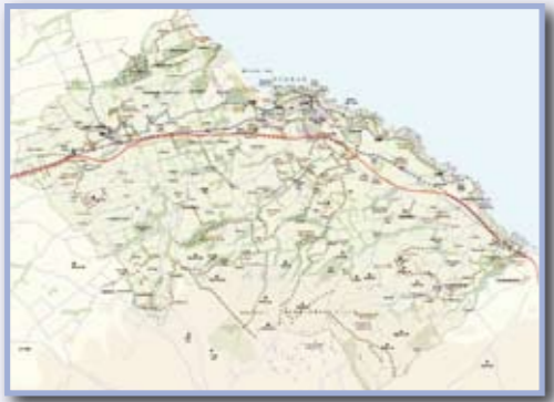
Outer side: Ward seven path map. Public transport map & information

Sustaining Dunbar, 16 West Port, Dunbar EH42 1BU Email: transport@sustainingdunbar.org